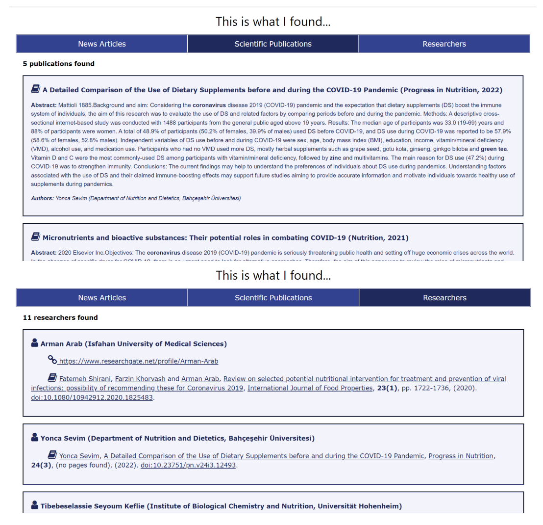
Figure 4: An example output from aedFaCT showing some of the retrieved scientific publications and their co-authors, respectively