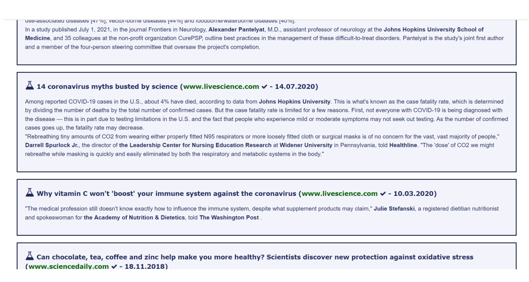
Figure 3: An example output from aedFaCT showing some of the retrieved news articles.

of information their profile contains to prioritise more contactable researchers. The bottom side of Figure 4 shows an example output from the user interface showing a list of researchers.